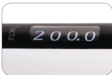
The volume is easy to read even when the pipette is angled.

The large, easy-to-read display helps you to see all four digits of the set volume from a distance without straining your eyes. The volume is easy to read even when the pipette is angled – eliminating the need to turn your head into an uncomfortable position.